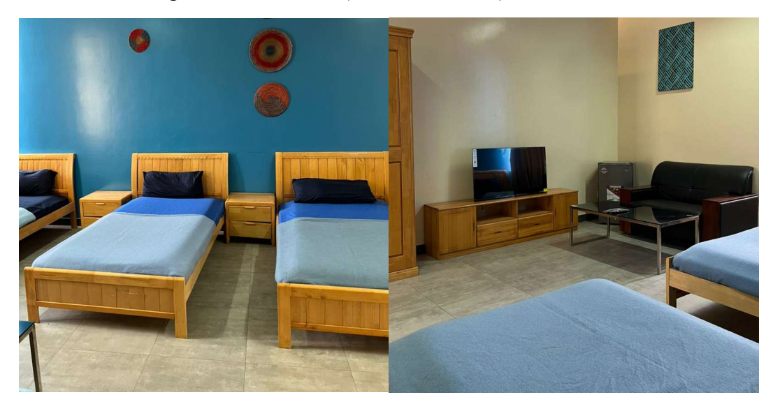
*Rooms for teams during the Olympic Solidarity Camp