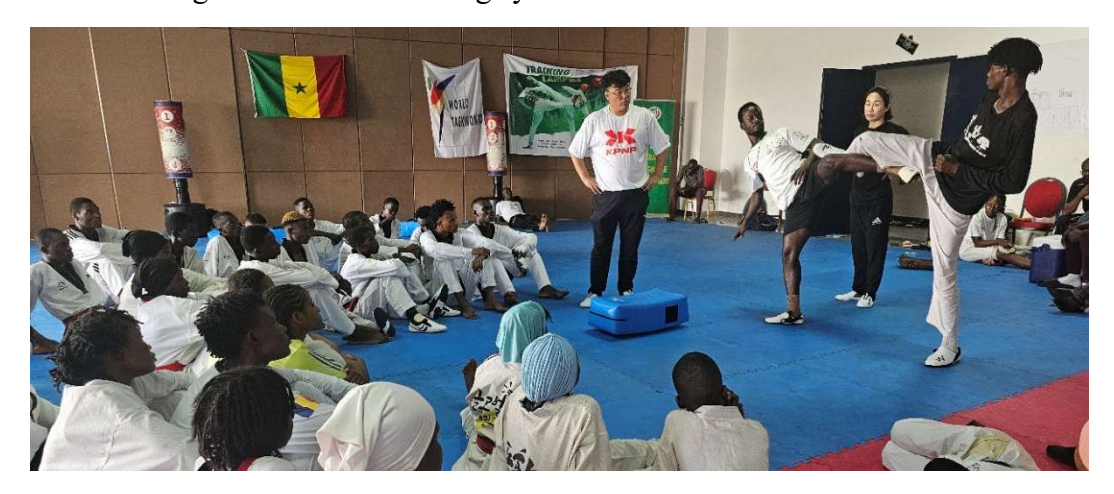
*WT Coach is providing guidance and demonstrations to participants

The structured approach of these sessions allowed athletes to develop a deeper comprehension of the tactical aspects of Taekwondo, improving their ability to execute precise and powerful techniques within the PSS framework. The training emphasized both individual skill development and the integration of these skills into cohesive tactical strategies, preparing participants for high-level competition. Through repetitive practice and detailed feedback from experienced coaches, participants were able to significantly enhance their proficiency and confidence in using the electronic scoring system.