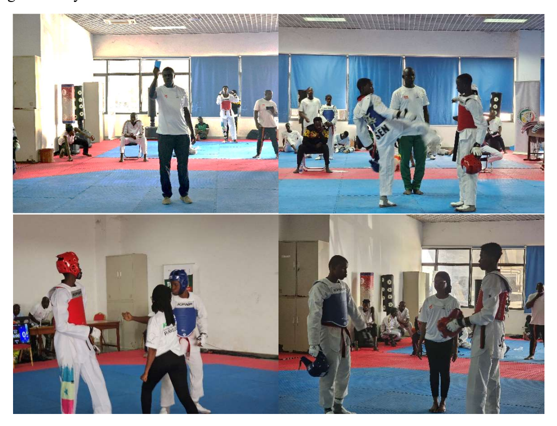
* Local referees are showcasing their skills during the PSS simulation training sessions at the camp.

Through these rigorous training exercises, referees improved their technical proficiency and built confidence in handling live competition pressures. This comprehensive training ensures Senegal's referees are well-prepared for both domestic and international events, raising the overall standard of Taekwondo officiating in the region. This initiative is expected to have a lasting impact, contributing to the sustained growth and professionalism of Taekwondo in Senegal and beyond.