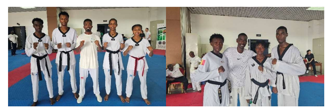
*Team Ethiopia (Left) / Team Chad (Right)