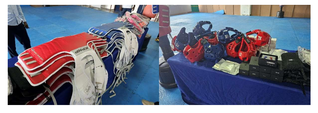
*Supported Protectors and Scoring System (PSS)