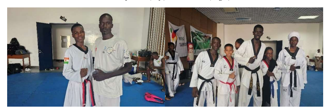
*Team Niger (Left) / Team Mauritania (Right)