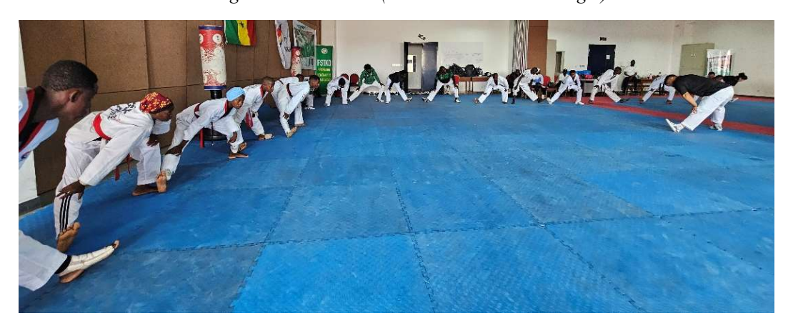
*Taekwondo National Team Training Room (Training Venue)