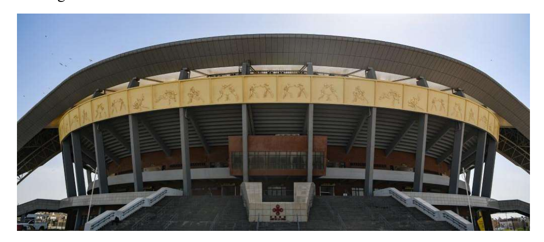
*Senegal National Arena (Arène Nationale du Sénégal)