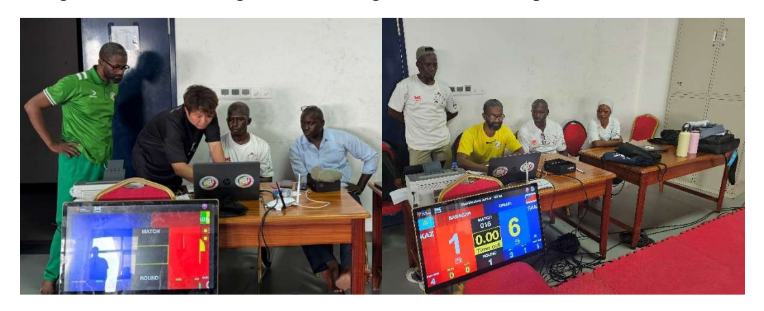
*Local officials took on roles as PSS operators, conducting mock operations

The long-term benefits of this initiative are significant. By developing internal expertise, WT can ensure more consistent and reliable event operations, reduce costs associated with external hiring, and foster a culture of continuous learning and improvement. This initiative not only strengthens the technical capabilities of current operators but also builds a robust foundation for future generations, ensuring the sustained growth and development of Taekwondo.