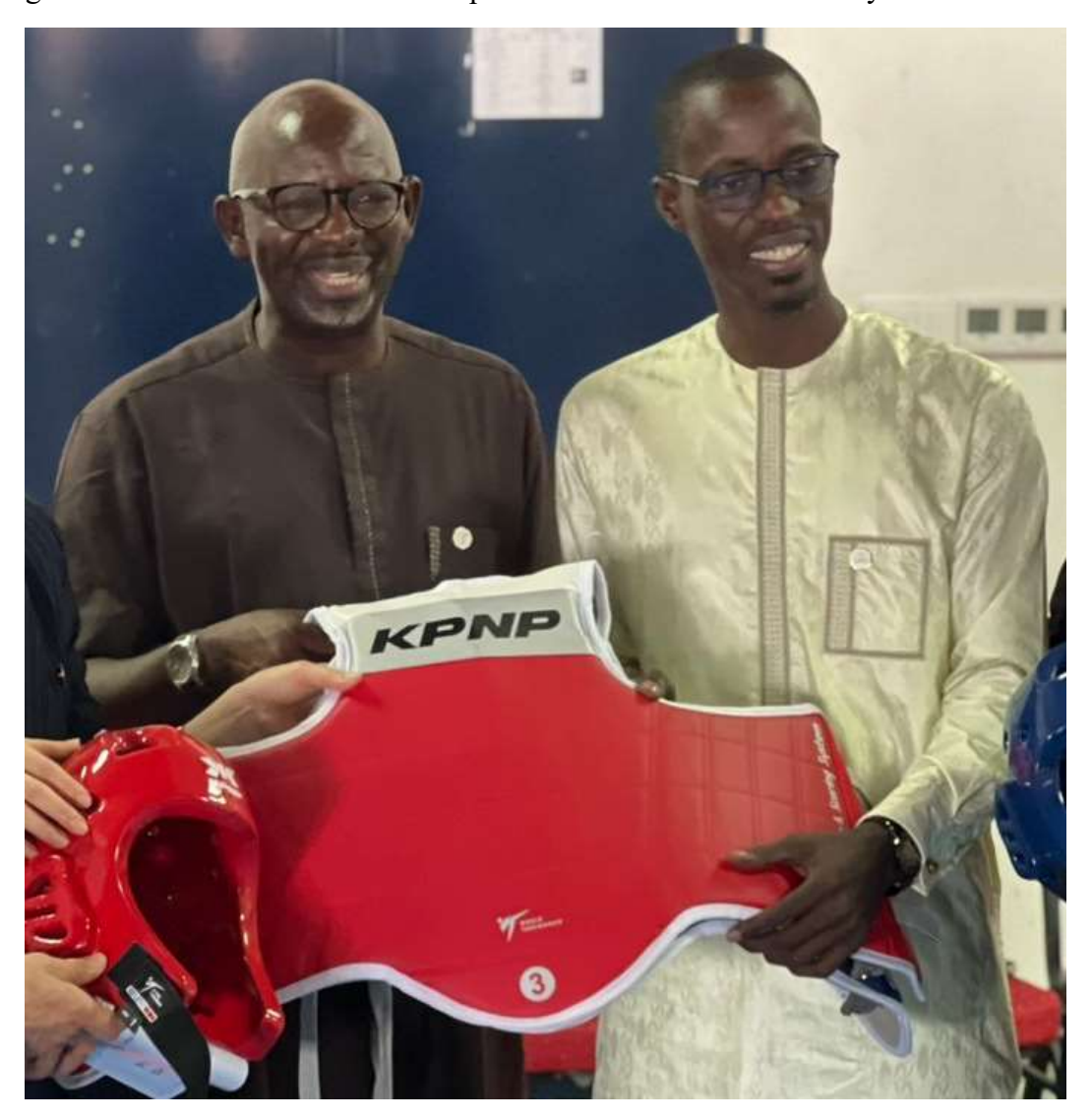
*Training Equipment (PSS sets etc.) with SEN NOC SG and SEN MNA President

PSS sets for training, electronic socks, Taekwondo kick pads, and T-shirts were provided for the WT Olympic Solidarity Camp 2024 for Youth. After being used for this training camp, these equipment items will remain in Senegal as a legacy. They are expected to significantly aid in the organization of future events and the promotion of Taekwondo locally.