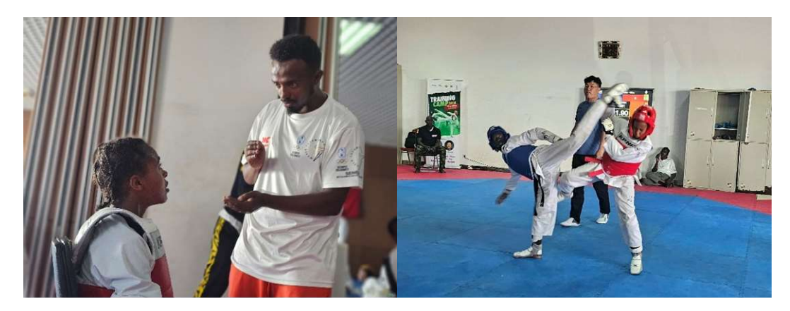
*A coach is advising his athlete (Left) / Participants are applying the techniques they have learned (Right)

Overall, the simulation matches were a highlight of the camp, offering both coaches and athletes a platform to put their training into practice and gain valuable insights for further improvement.