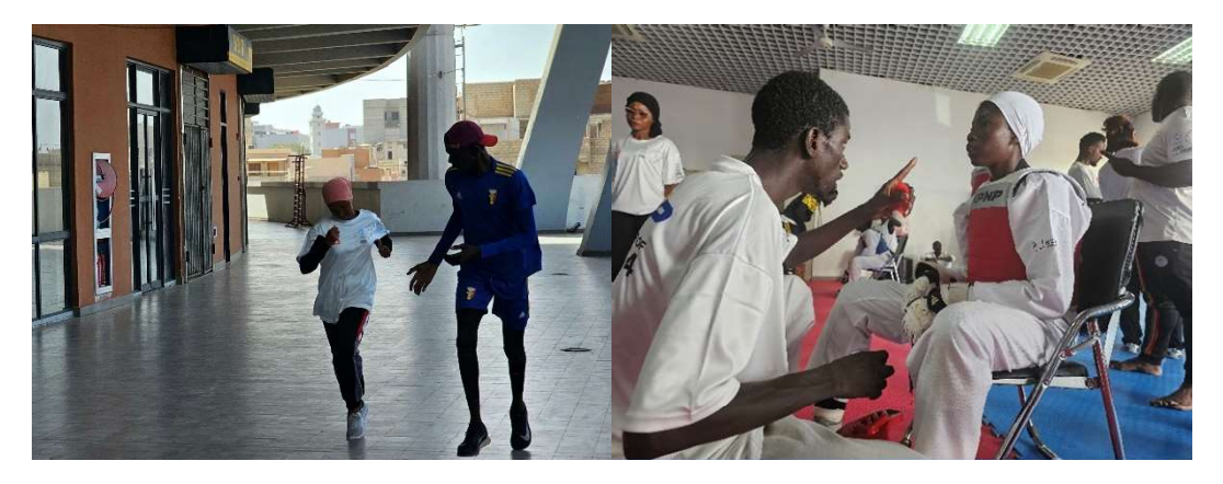
*Coaches are actively encouraging and guiding athletes during training sessions.

Overall, the camp provided a comprehensive educational experience, equipping coaches with the tools to enhance their effectiveness. By integrating scientifically-based training methods and tactical insights, coaches are now better prepared to contribute to their athletes' success, ultimately raising the standard of Taekwondo coaching and performance in their respective countries.