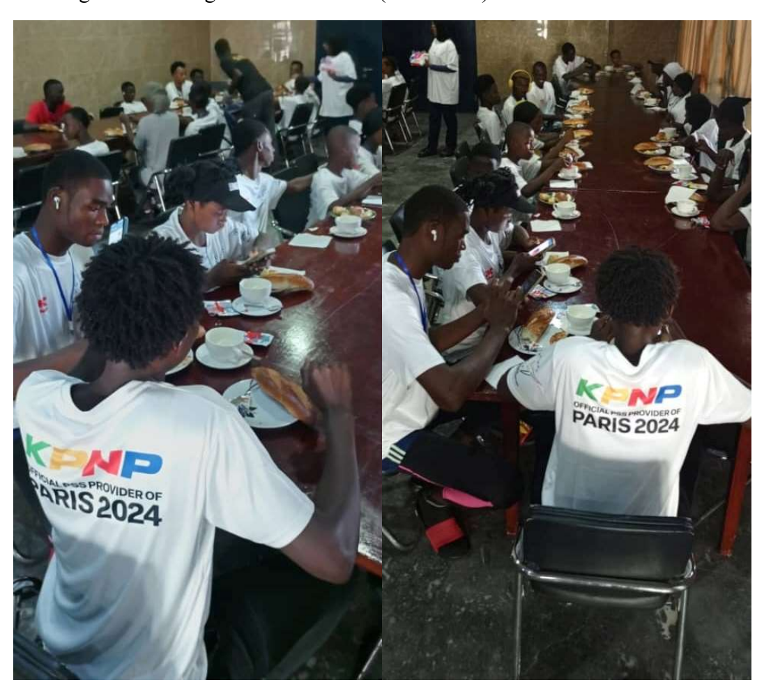
*Participants are having a meal in the dining hall at the Senegal National Arena