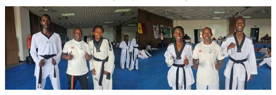
*Team Zambia (Left) / Team Zimbabwe (Right)