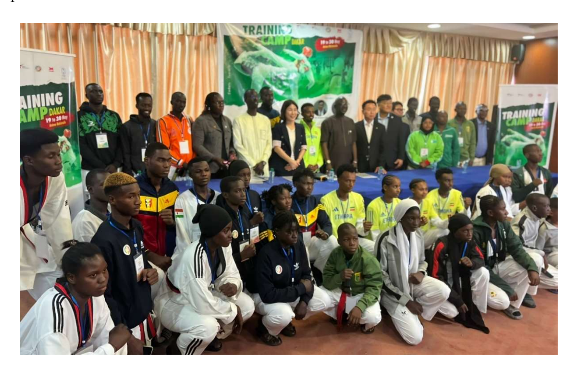
*Group photo of participants at the Opening Ceremony of the WT Olympic Solidarity Camp 2024 for Youth

A total of 32 youth athletes and 10 coaches from 9 different countries participated in the event. Additionally, 3 local officials served as PSS operators, and 4 referees were also present. Initially, invitations were extended to 10 countries; however, one country could not participate due to passport issuance issues.