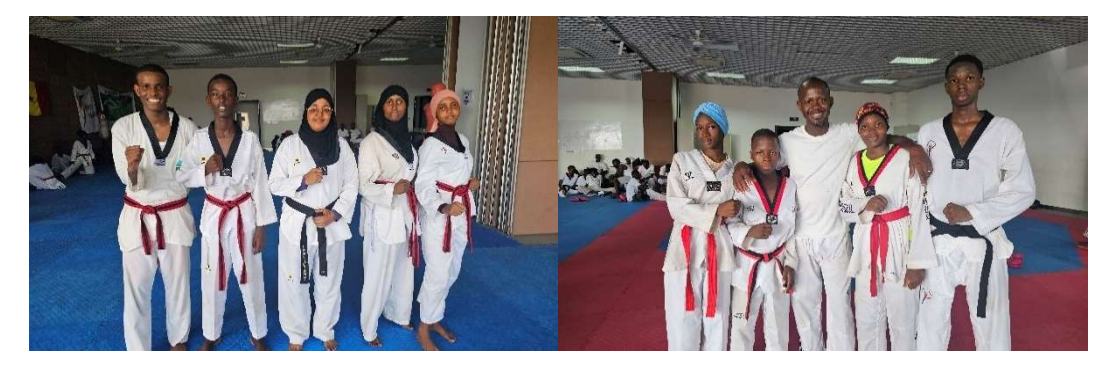
*Team Djibouti (Left) / Team Mali (Right)