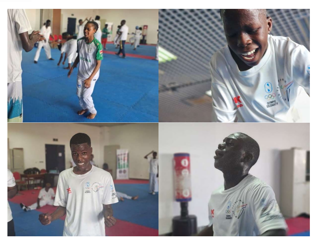
*The young participants are putting in valuable effort and hard work throughout the camp period.

Overall, the camp's success highlights the effectiveness of the intensive training methods. The dedication and enthusiasm of the young athletes, combined with the coaches' adaptive strategies, resulted in substantial skill development. These youth athletes are now better equipped for future competitions, laying a strong foundation for their continued growth in Taekwondo.